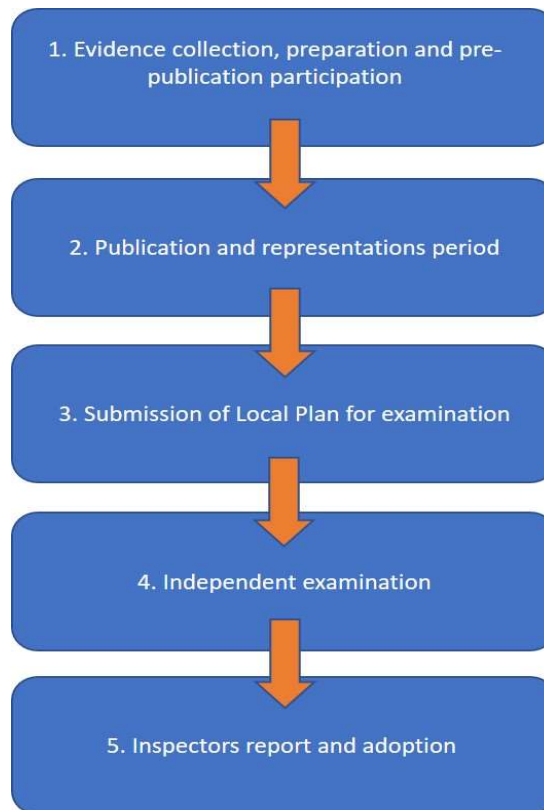
Figure 3: Local plan preparation